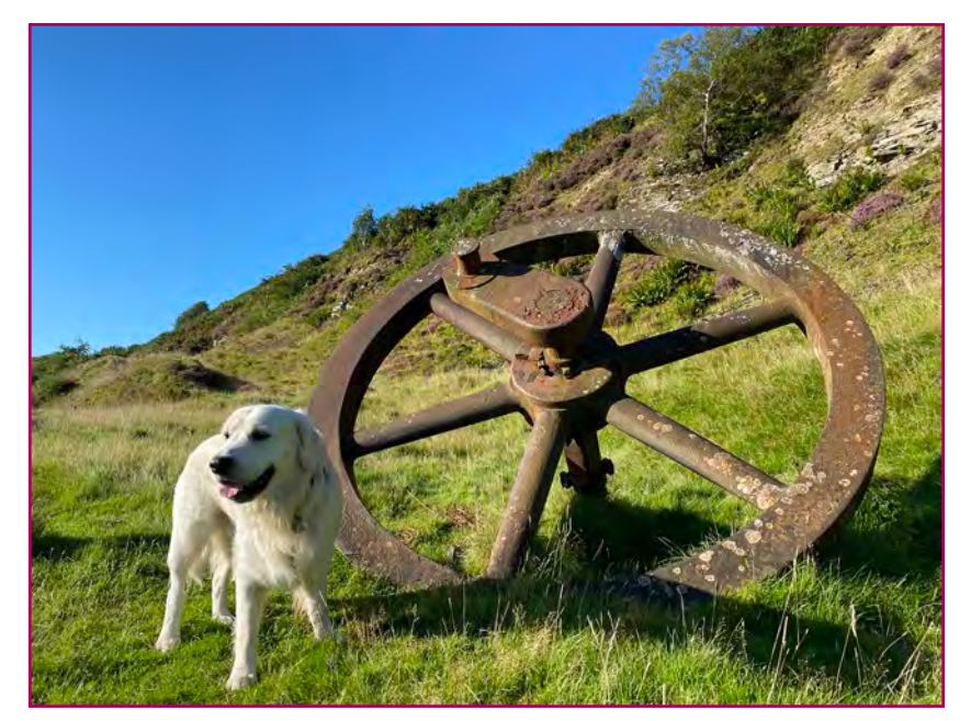
Cover Photo: "The Wheel", Ebbw Vale.